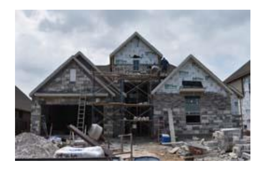
Single-Family Residential Under Construction