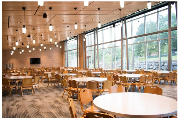
Martin Dining Commons