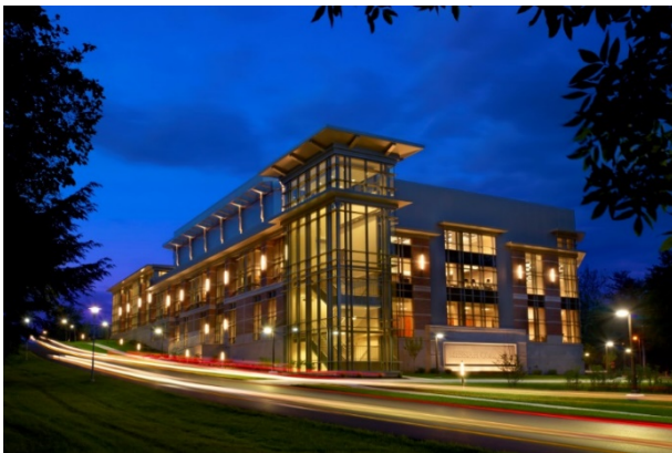
Calvin and Janet High Center for Worship and Performing Arts

In 2013 the University opened its new Calvin and Janet High Center for Worship and Performing Arts, which was funded entirely with gifts and internal funds. During the past five years, the University raised 100% of the funding for its new artificial turf field for lacrosse and soccer, as well as the Martin Dining Commons, a 4,800 square foot addition to the University's dining hall. The University is proud of its ability to successfully raise funds for project specific facilities as needs arise. Although Messiah recently celebrated its 100 th anniversary in 2009, 80% of its alumni (living & deceased) graduated during the most recent thirty years. The University has been the recipient of many generous contributions from both alumni and a greater community of friends despite its youth.