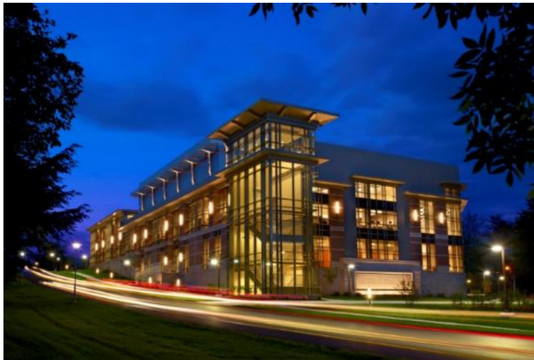
Calvin and Janet High Center for Worship and Performing Arts

In the opinion of the University, there has been no material adverse change in the financial condition of the University since June 30, 2019, the most recent date for which audited financial statements are available, except as set forth below under "COVID-19 Matters" and "Management's Discussion - Balance Sheet Resources, Results from Operations and Conclusion".