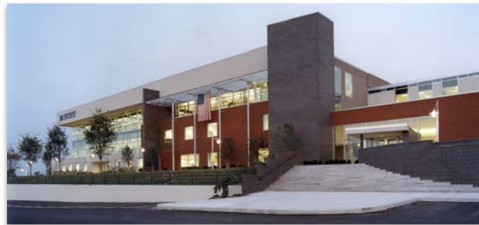
Location of Graduate Health Science Programs

Approximately ten years ago, the University began to strategically contemplate the addition of key graduate programs which would complement Messiah's niches and build on its long-standing academic strengths. Now ten years strong, graduate programs have witnessed steady growth and are an important addition to the University's revenues. The following information summarizes the growth of Messiah graduate activities.