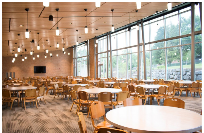
Martin Dining Commons